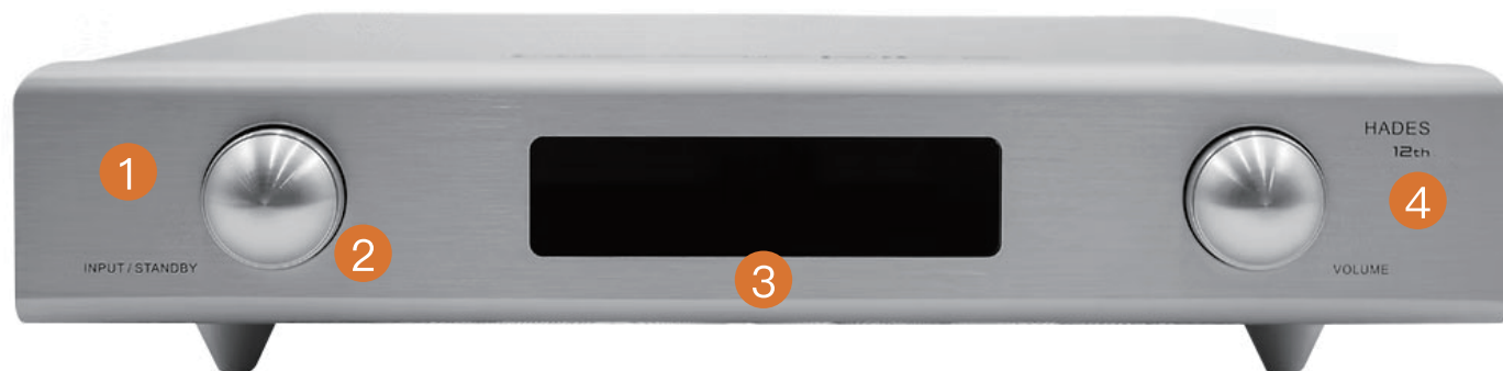
Figure 1. Front Panel