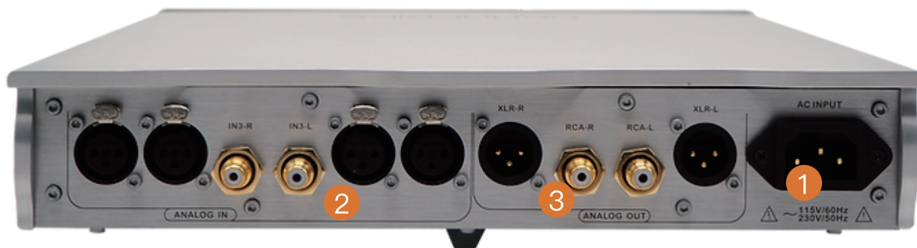
Figure 2. Read Panel