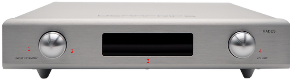
Figure 1. Front Panel