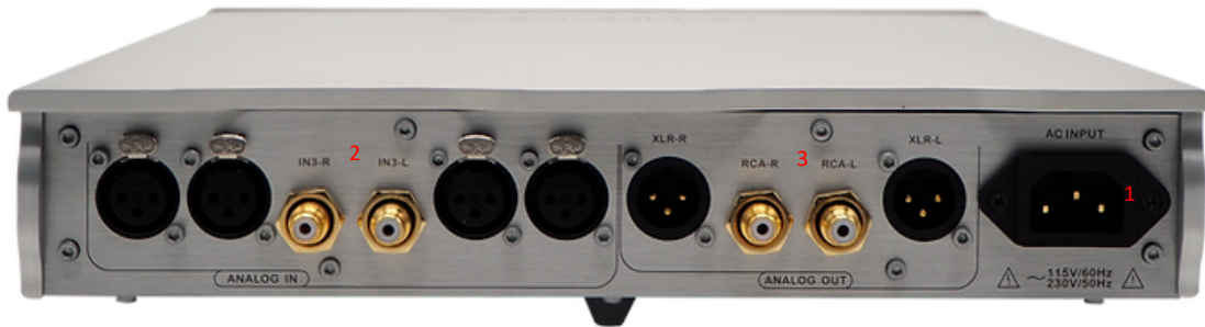
Figure 2. Rear Panel