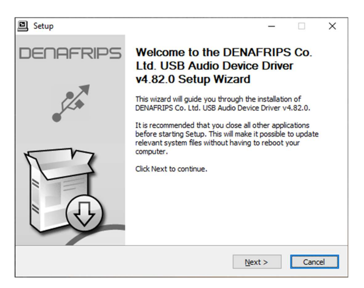
Figure 4. Welcome screen