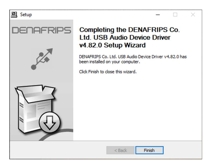
Figure 7. Completed