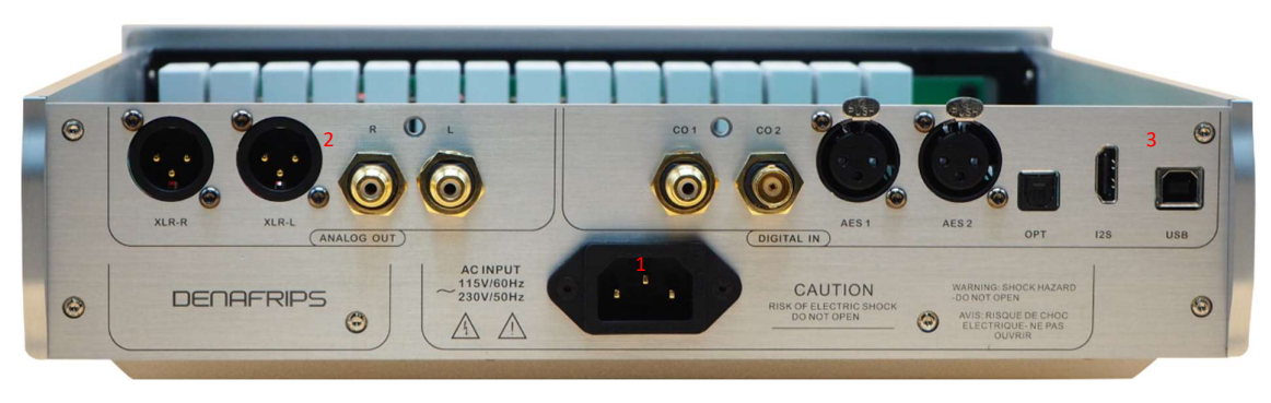
Figure 3. Read Panel