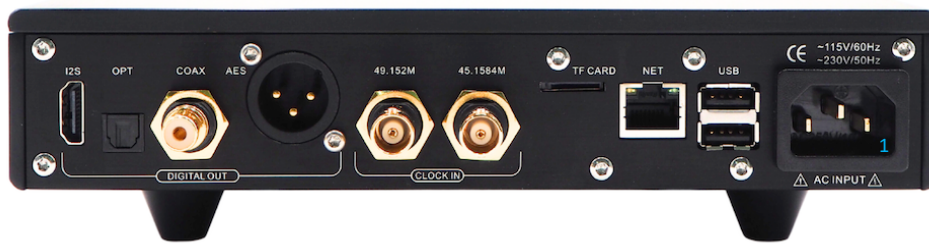
Figure 2. ARCE STREAMER Rear Panel