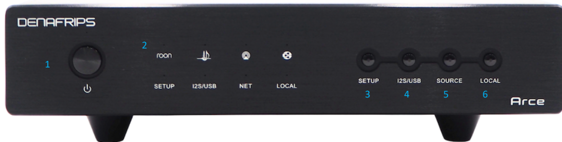
Figure 1. ARCE STREAMER Front Panel

The ARCE STREAMER is easy to use. Nonetheless, please read this section to fully understand the functions and features available.